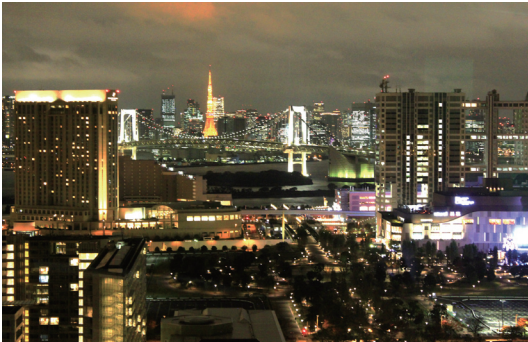
Night view of the Tokyo Waterfront Area